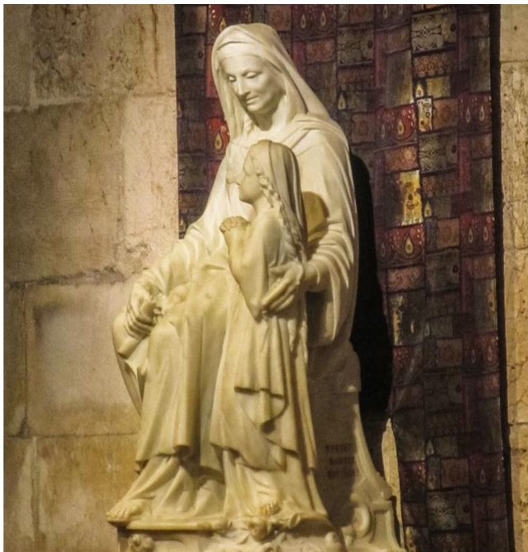
Statue of St Anne and the young Virgin Mary, Church of St Anne, Jerusalem

Sixteenth Sunday of the Year 21 July 2024